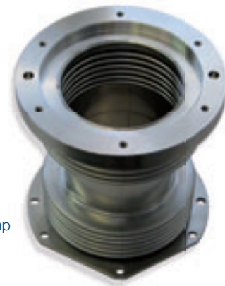
Bellows as a centre-piece of a vacuum pump

The BOA Group has cleaning and drying processes which are specially coordinated to suit the subsequent utilization of products in the vacuum.