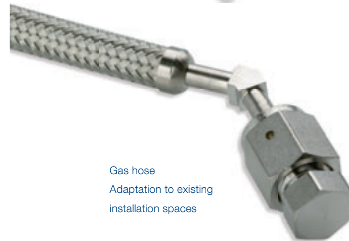
Gas hose Adaptation to existing installation spaces