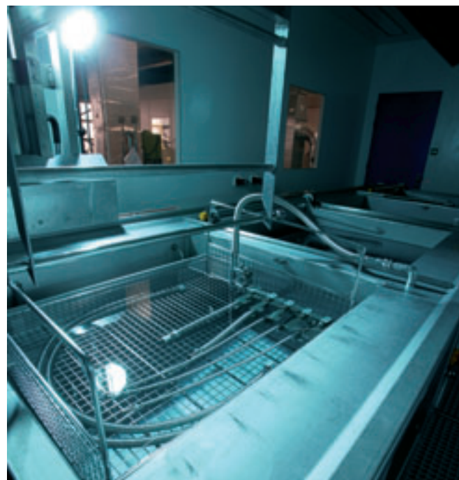
Classes 5, 6 and 7 clean rooms